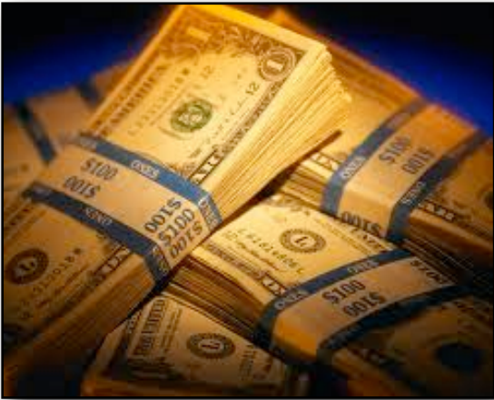
PV900 Cash Tracker

The Digital RF PV900 is a small battery powered flexible circuit board which uses the latest GSM technology to provide a location typically to an accuracy of within 100m.